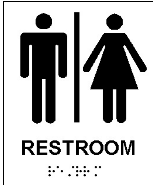
Typical Restroom Sign

Pictogram background field 6" minimum height